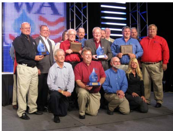
Shown in picture above is the staff and board of directors with the awards that Illinois Rural Water Association received at the NRWA Annual Conference held in Louisville, Kentucky.

Speaking of awards, the first week of November was spent visiting the facilities of those that were nominated for plant and/or operator of the year for Illinois Rural Water Association. Once the visits had been completed a total of 1600 miles will have been logged. As in past years, the scoring and final determination of the winners has been extremely difficult. While there can only be one winner I can honestly say that there were no losers either. Every one of the sites visited and operators interviewed are certainly deserving of the award. Be sure and attend the IRWA Annual Conference in Effingham on February 16 - 18, 2010 to find out who this year's winners are.